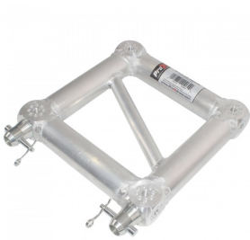
F32 6 Way Universal Box Junction | 3mm Wall SKU: XT-F32JBOX